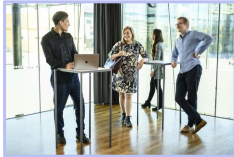
Events & Meetups